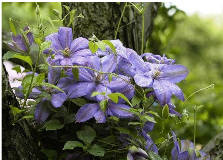
Clematis Mrs Cholmondeley