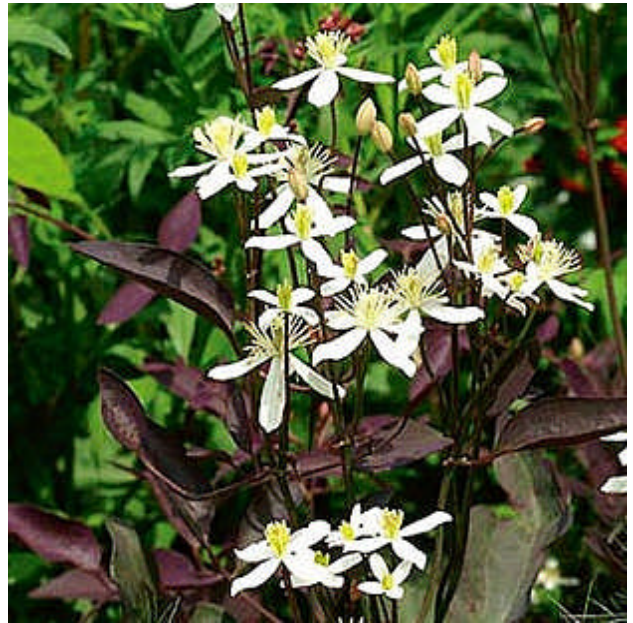
Clematis recta purpurea

The plants in this group flower on new foliage that emerges directly from the ground. The previous year's foliage needs be cut back hard to the ground within 6" of the soil every spring. This is the only group in which pruning is required every year, but also the easiest, because you do not have to worry about leaving any buds for current growth. Plants in this group include: C. integrifolia and C. recta purpurea .