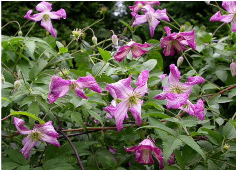
Clematis viticella 'minuet'

Plants in this group flower on the last 24-36 inches of the current season's growth. Some types begin blooming in mid-June and continue into the fall. This is the easiest group to prune since no old wood needs to be maintained. In February or March cut each stem to a height of about 24-36 inches. This will include removal of some good stems and buds. Eventually the length of the bare stem at the base will increase as the vine matures. Plants in this group include: C. viticella , C. flammula , C. tangutica , C. x jackmanii , C. maximowicziana , 'Perle d'Azur,' 'Royal Velours,' 'Duchess of Albany' and others.